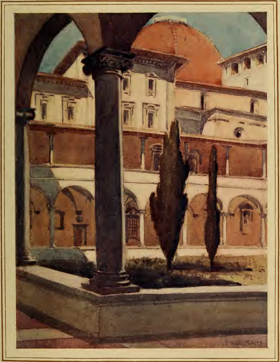
THE CLOISTERS OF S. LORENZO, SHOWING THE WINDOWS OF THE BIBLIOTECA LAURENZIANA